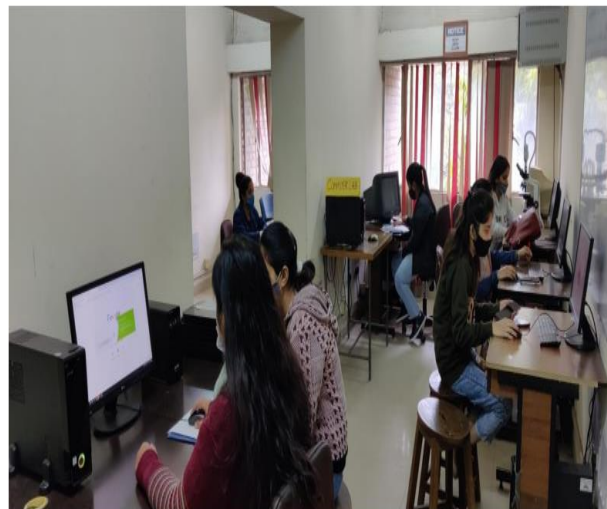
CAD Lab (Room No. 36)