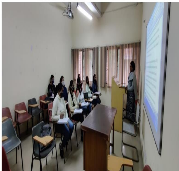
Classroom no 44