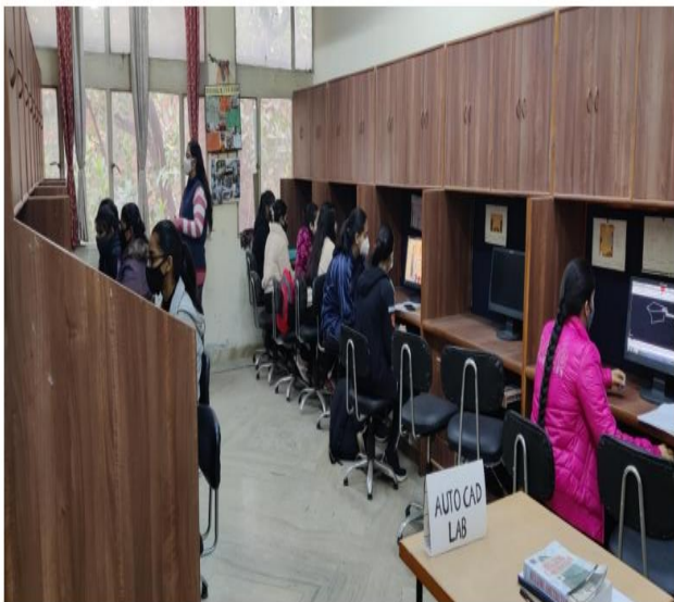
Auto CAD Lab