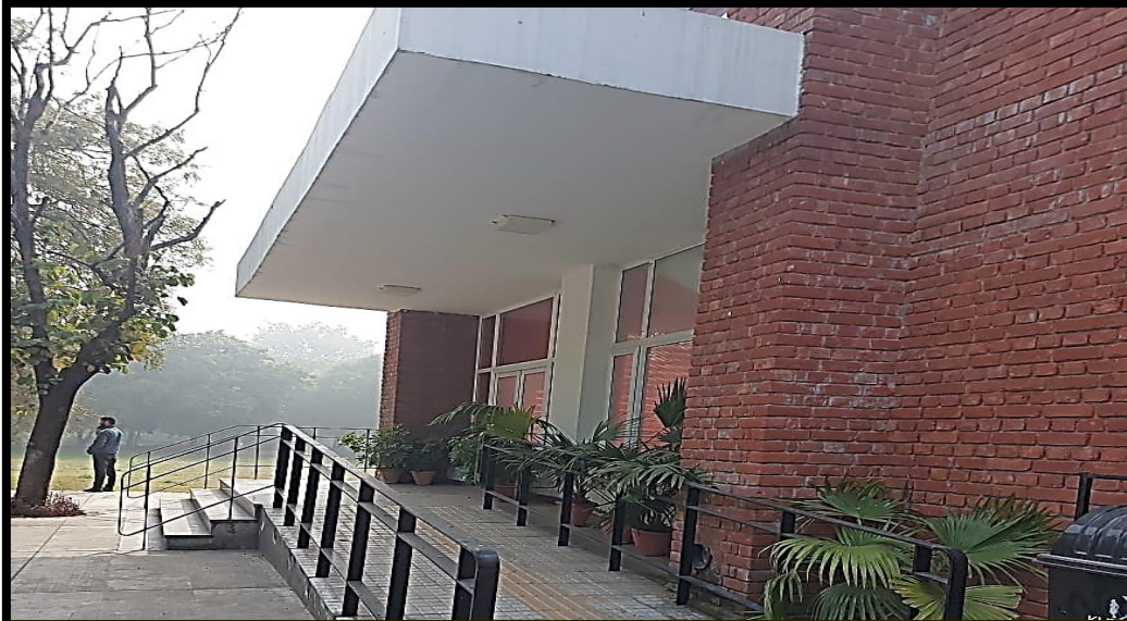
Slopes, Ramps and Staircases with Hand Rails, Tactile Vitrified Flooring

There is provision of wheelchairs, slopes, ramps, and staircases with hand rails, tactile vitrified flooring for Divyangjan