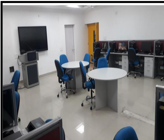
Room No 10 e-PG Pathshala

https://homescience10.ac.in/ict-facilities