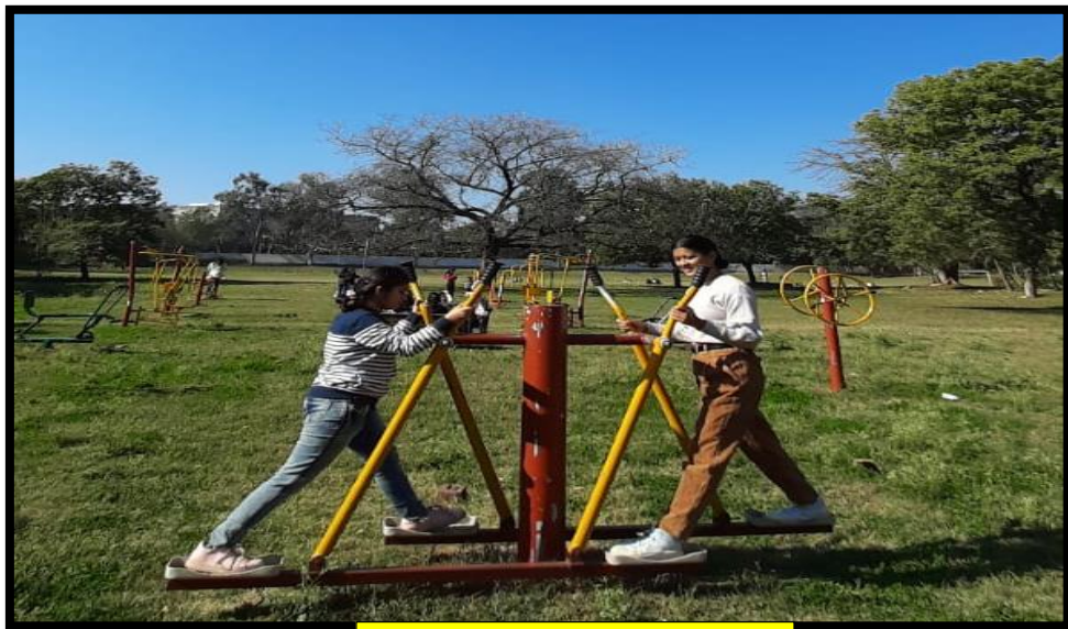
Open Air Gymnasium