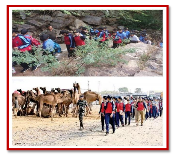
Trekking Expedition in Ajmer, Rajasthan