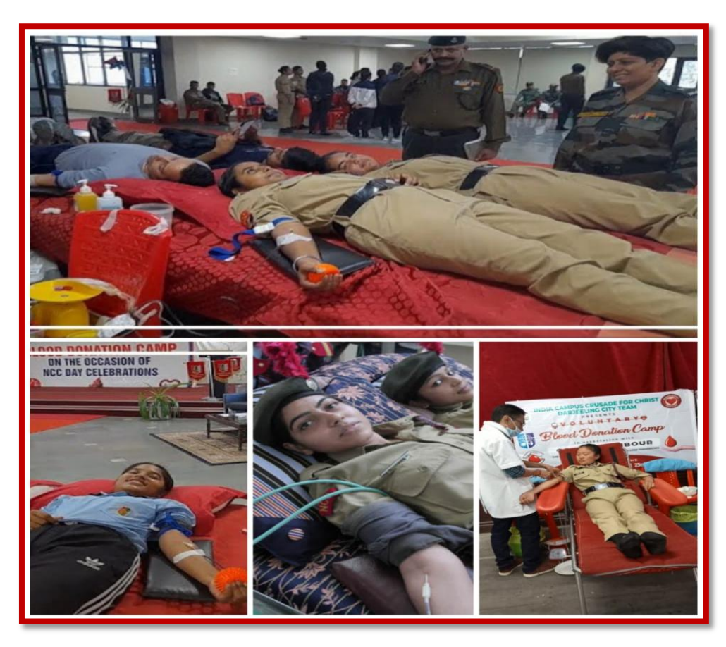
Blood donation camp