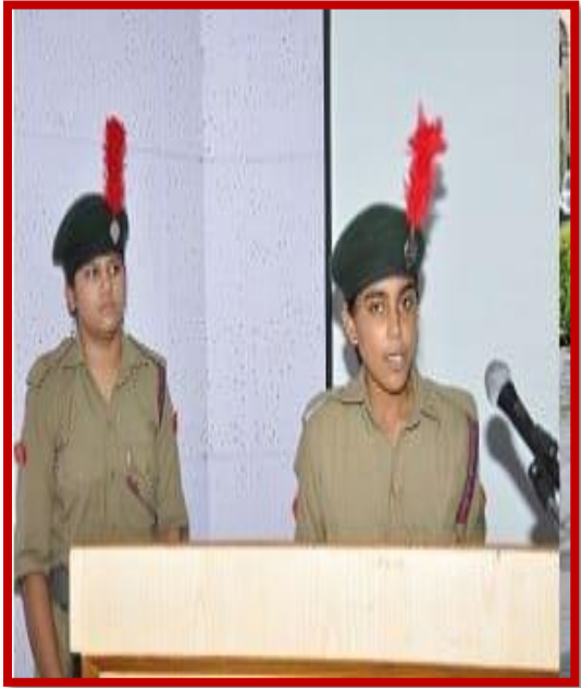
Basic Leadership Camp in Malout