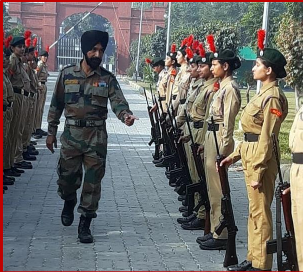
Ek Bharat Shrestha Bharat camp in Amritsar