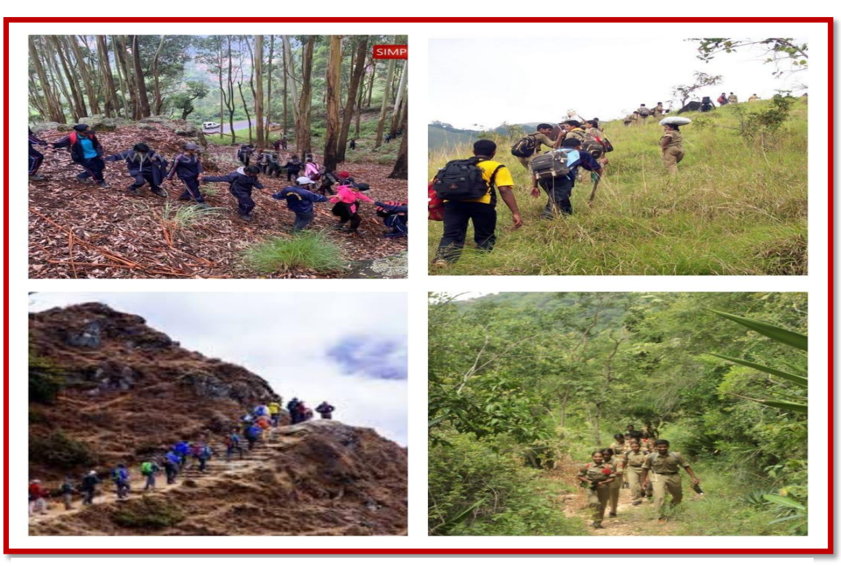
Trekking expedition in Himalayas