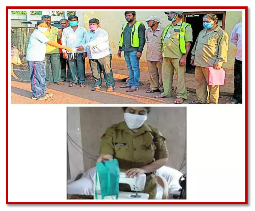
Mask preparation and distribution

With the COVID-19 pandemic continuing to harrow everyone, especially the frontline workers tasked to mitigate the crisis, in a commendable gesture worthy of emulation, NCC Girl Cadets from 1 CHD GIRLS BN, had come forward with the initiative of locally stitched high-quality pleated cotton face masks for District Authorities. The first lots of masks have been handed over to Chandigarh administration. As per PMO's directions on "Mask India Movement" 1 CHD GIRLS BN, NCC Chandigarh, took initiative of stitching masks. It is a proud moment for them since the initiative was started by the girls themselves further motivated by the Commanding Officer of 1CHD GIRLS BN, for the cause of humanity. They are doing a great deal of work sourcing cotton clothes themselves and stitching high quality pleated masks. Since the lockdown has made availability of cotton scarce, NCC is working on sourcing the clothes to the girls.