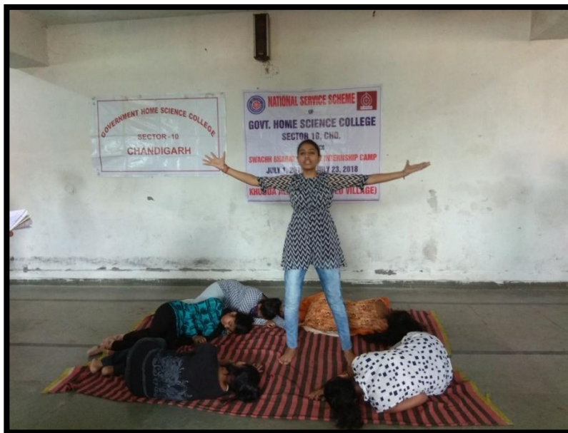
Performing Nukkad Natak