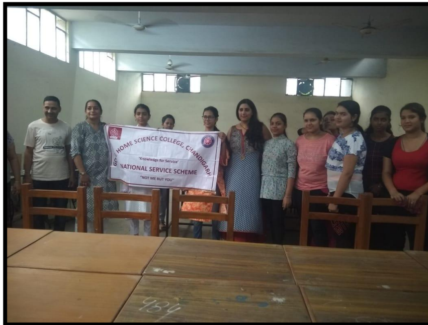
Cleanliness Drive at Government Home Science College