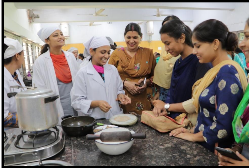
Demonstration of Low cost Iron rich recipes