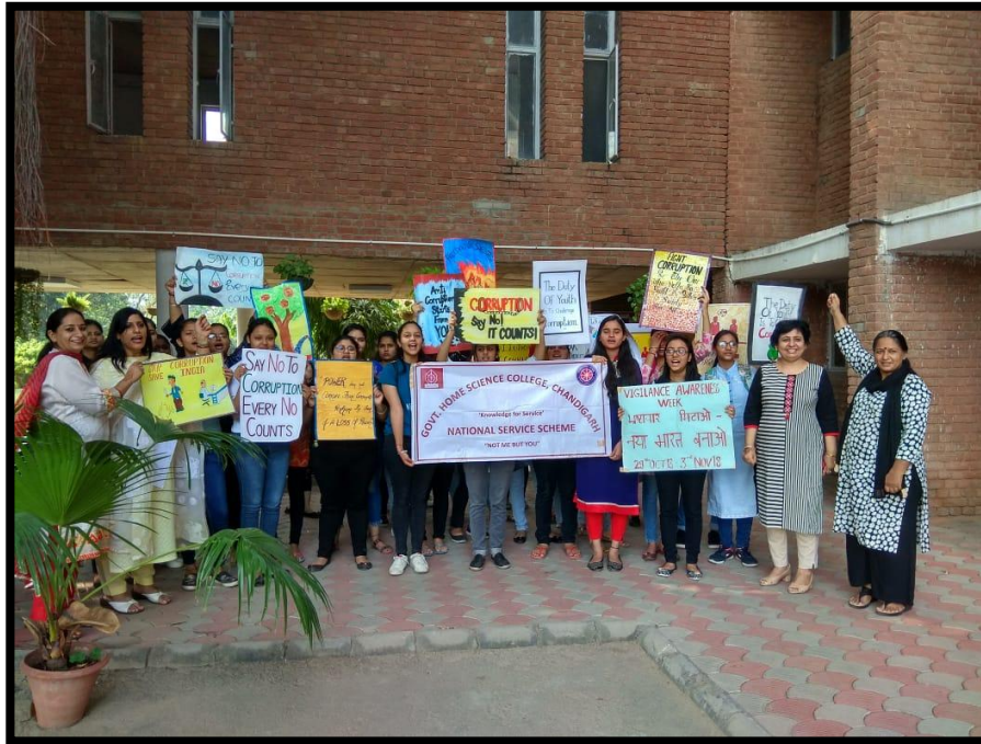
Awareness Rally to Fight against Corruption

Vigilance Week was observed by organizing an essay writing competition on the theme 'Are Ethics and Values an antidote to Corruption'.