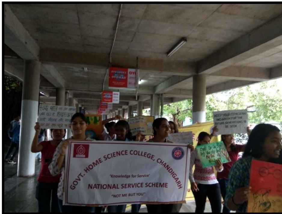
Visit to Welfare Agencies