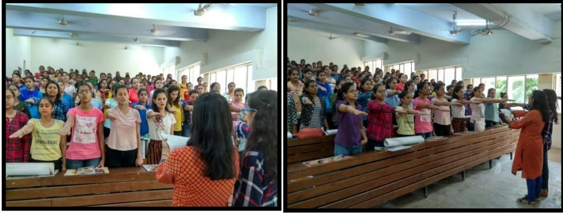
Swacchta Shapath by NSS Volunteers