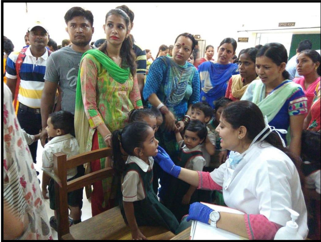
Dental Health Check Up