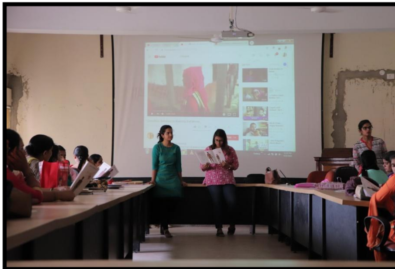
Team from Social Work Department, Panjab University