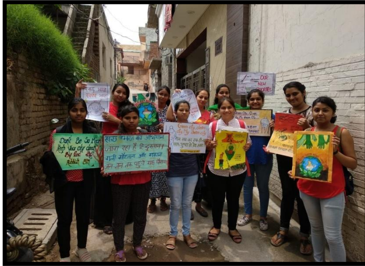
Students organized a rally with an aim to divert people's attention to the cleanliness of their neighborhood and society.