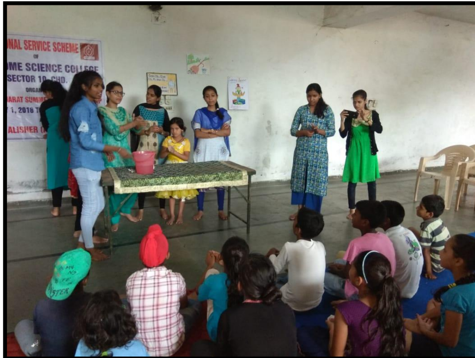
NSS Volunteers demonstrating techniques of Personal Hygiene.