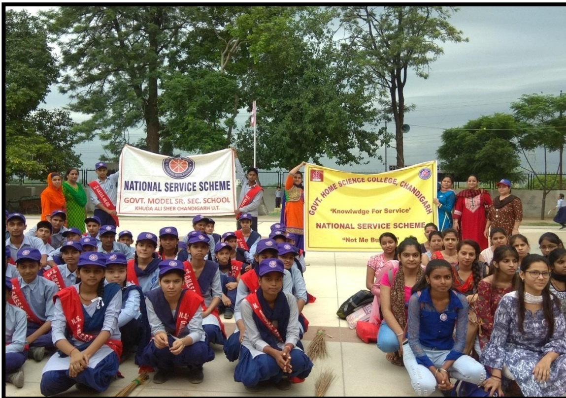
Cleanliness drive in collaboration with the Government Model School, Khuda Ali Sher.