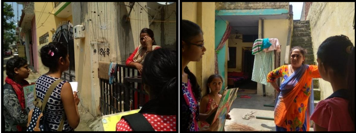
Door to Door Campaign