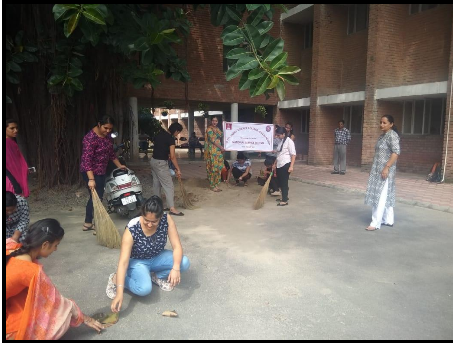
Cleaning of College Internal Roads