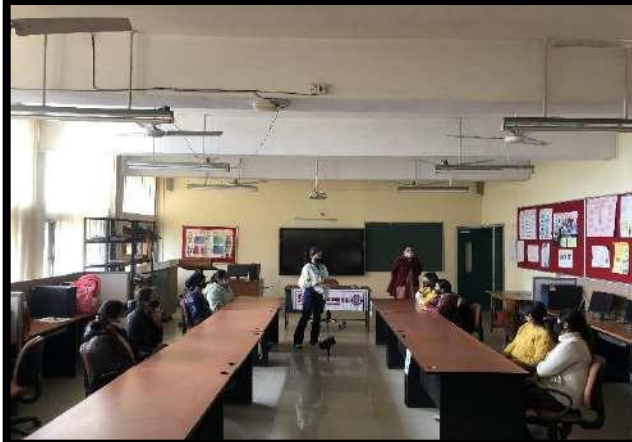
Glimpses of Quiz Competition on the topic 'Tool of Democracy-Voting Rights'