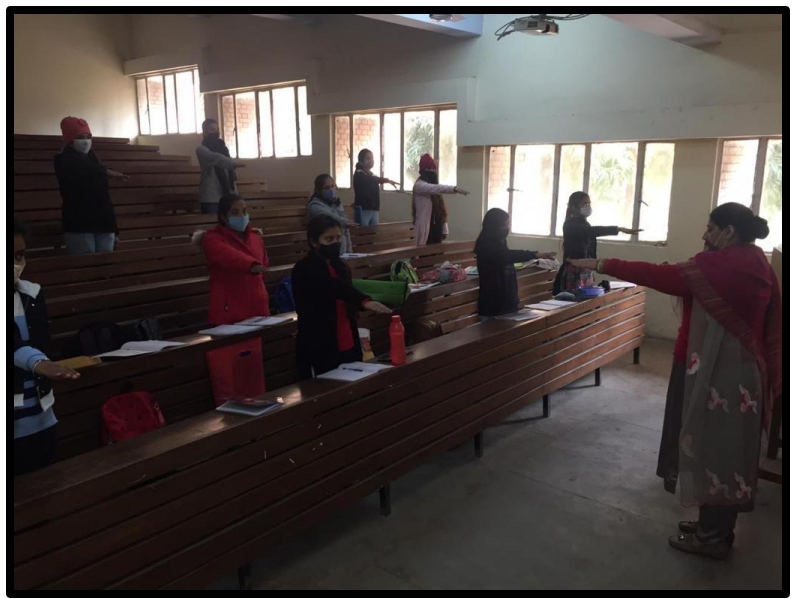
NSS volunteers took pledge on National Voter's Day