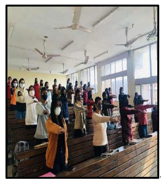
Glimpses of pledge taking