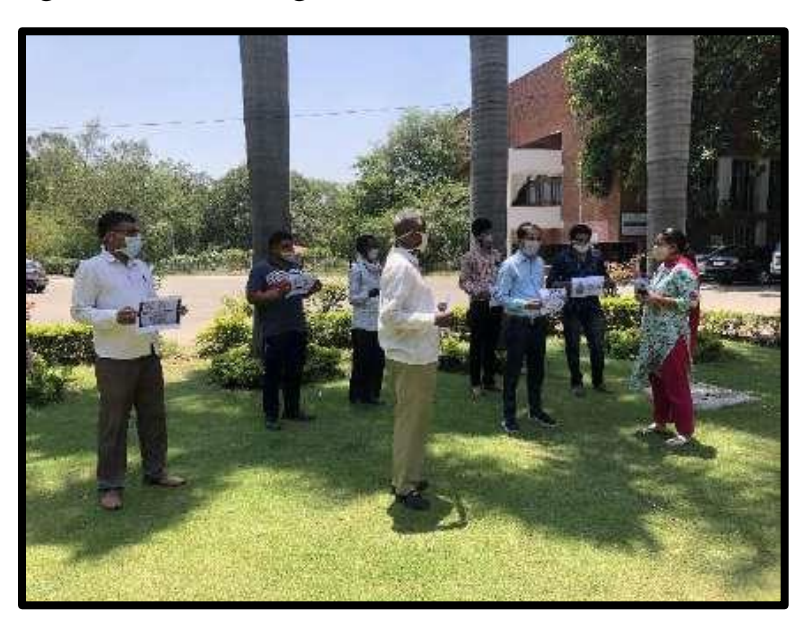
Gandhi Chhadi Innovation for Waste collectors

NSS Volunteers participated in Phase 1 (27.12.2021 to 31.12.2021) NSS Volunteers participated in Voting Awareness Programme' held from December 13 to 16, 2021