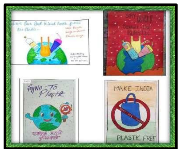
Glimpses of Poster Making & Slogan Writing Competition