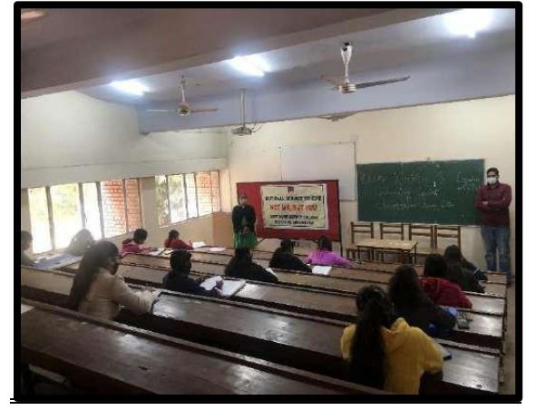
Essay writing competition in two-day NSS camp