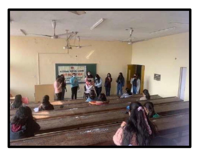
Glimpses of Street Play