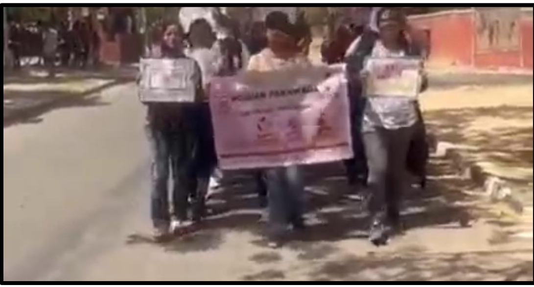
NSS volunteers participated in celebrations of Poshan Pakhwada under Poshan Abhiyaan from March 16-31, 2021.