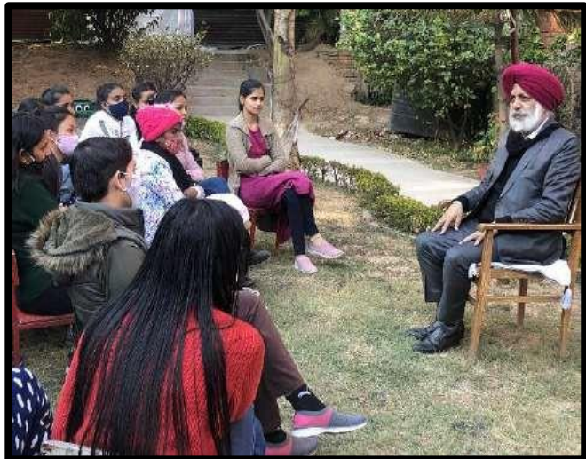
Glimpses of the session