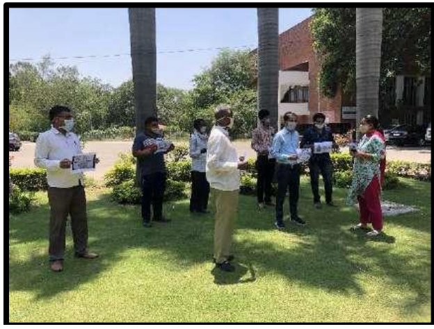
Glimpses of Interaction with Sweepers