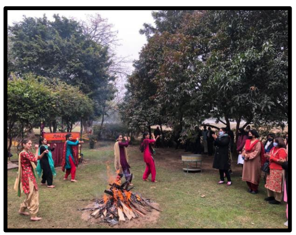
Lohri and Makar Sankranti celebration on the theme Beti Bachao, Beti Padhao