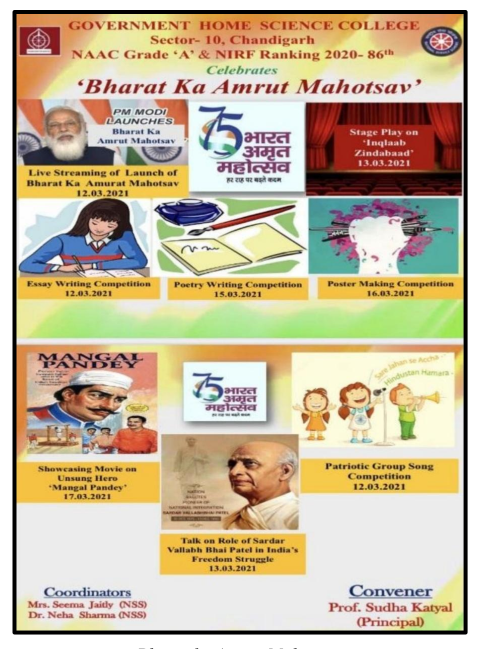
Bharat ka Amrut Mahatsay

On the launch of Bharat ka Amrut Mahatsa, live streaming of the launch of "Bharat ka Amrut Mhaotsav" was organised by NSS wing of Government Home Science College Sector 10 Chandigarh. Various other activities like Essay writing, poetry writing, poster making were also organised.