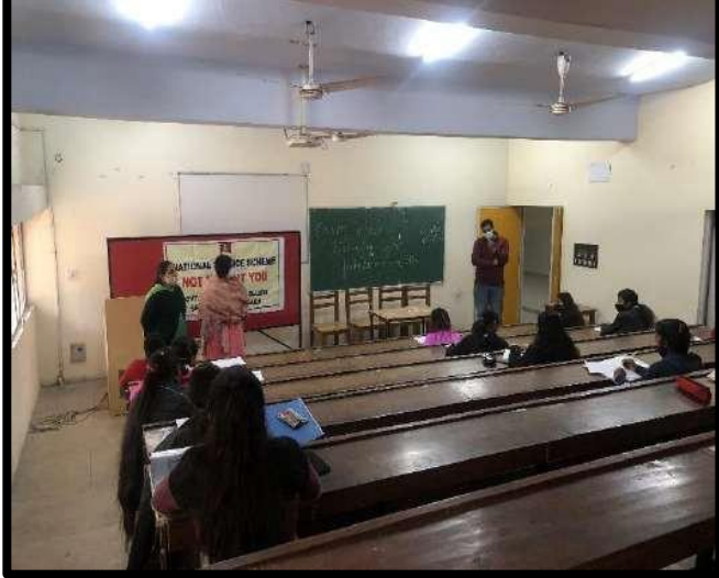
Glimpses of Essay Writing & Declamation Contest for spreading awareness regarding elections and significance of voting