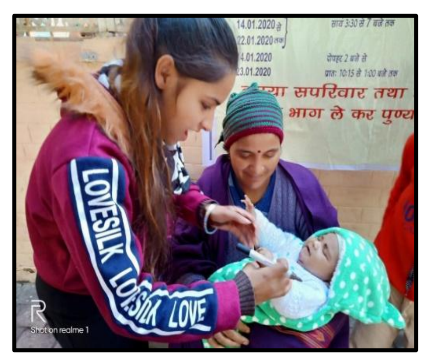
Door to door Pulse Polio Distribution Drive