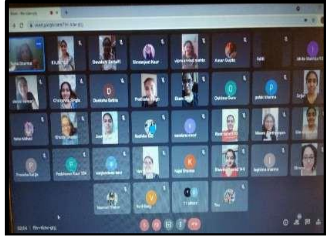
Glimpses of Virtual Rally