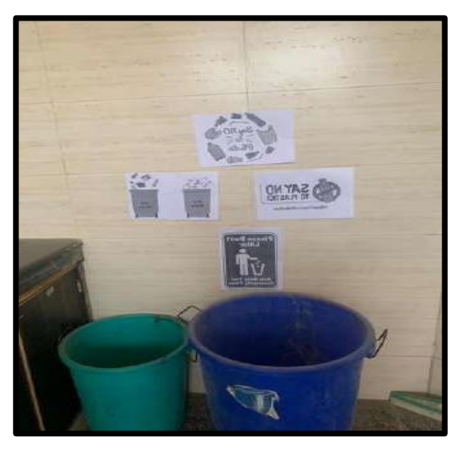
Glimpses of display of sign boards regarding segregation of waste and dustbin