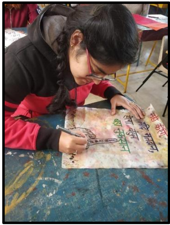
Slogan writing competition on Republic Day