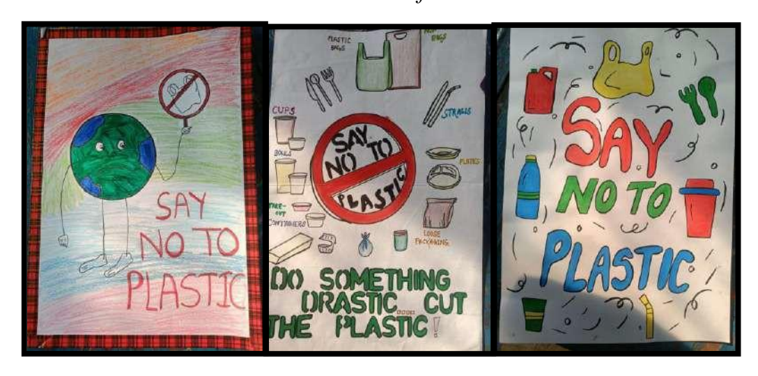
Glimpses of Swacchta Abhiyan and Gandhi Chhadi