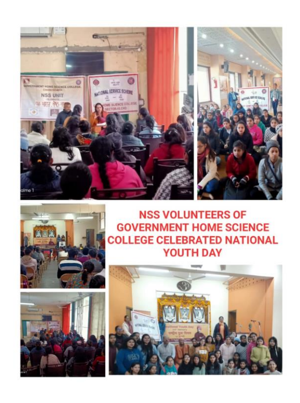
January 13, 2020