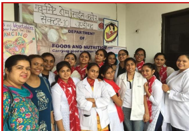
Students of GHSC- 10 participating in Poshan Mela at Daria

Link for the Activities- https://homescience10.ac.in/news-events?page=12