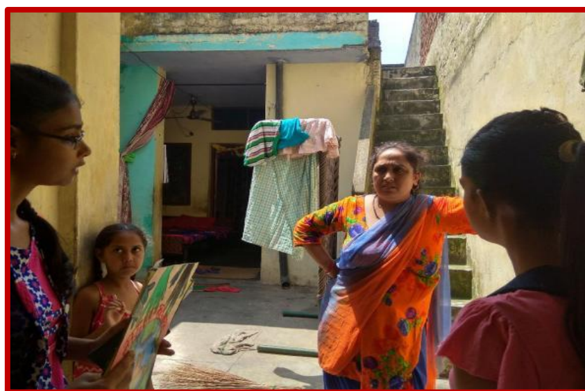
NSS students participating in Hygiene and sanitation campaign

Link for the Activities- https://homescience10.ac.in/news-events?page=13