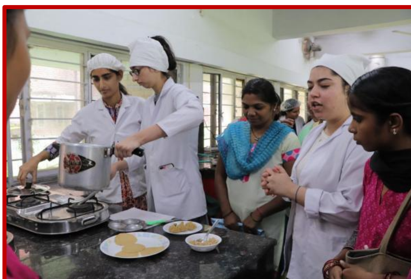
Celebration of Poshan mah at GHSC- 10

Link for the Activities- https://homescience10.ac.in/news-events?page=13