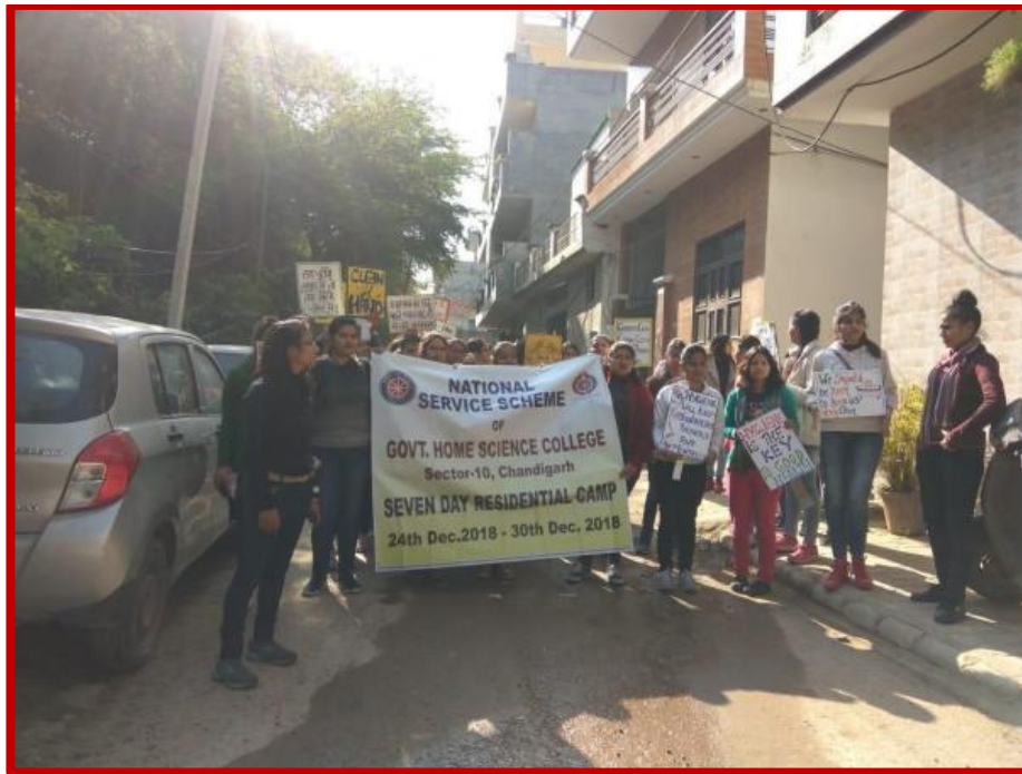
NSS students showcasing their Posters