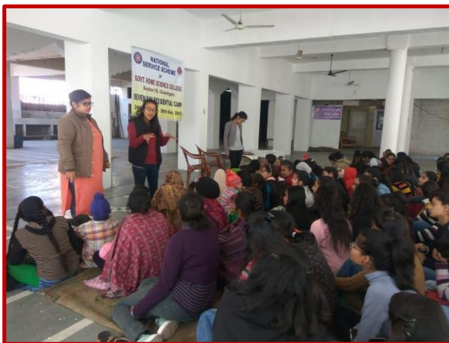
NSS students sensitising people about their health