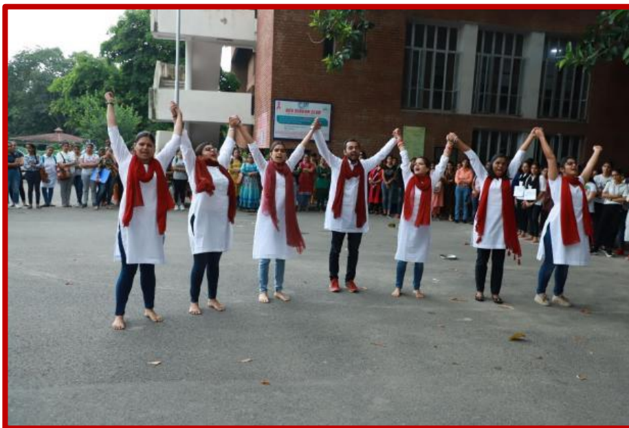
Celebration of Akshay Urja diwas at GHSC- 10

In order to sensitize our young generation regarding the significance of renewable sources of energy and various Scientific Innovations achieved in this field, Harita- the Environment Society of Government Home Science College, Chandigarh and NSS observed the Akshay Urja Diwas sponsored by Chandigarh Renewable Energy and Science and Technology (CREST) , Chandigarh Administration with great enthusiasm. The theme of Akshay Urja Diwas was 'Impact of Akshay Urja in India'. To promote the cause, a walkathon was organized on August 14, 2018 to generate awareness regarding the importance of conservation of Akshay Urja (Renewable sources of energy).