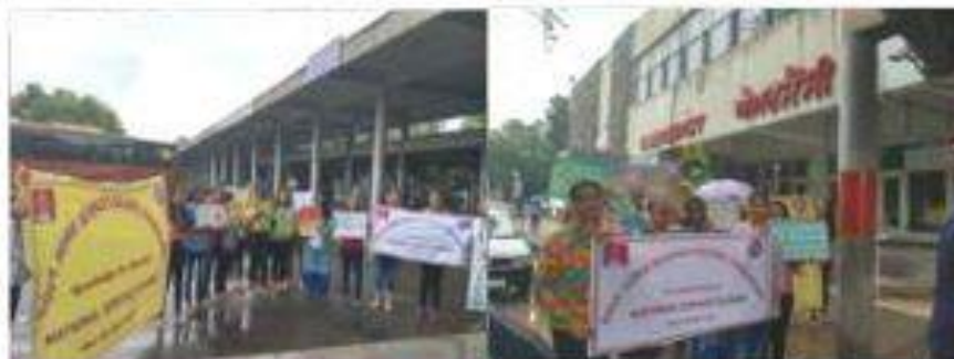
Cleanliness drive Bus Stand, Sec-17, Chandigarh

NSS volunteers observed Swachhta Pakhwada through a cleanliness drive at GMSH 16, Market of Sector 10, Bus stand of Sector 17 and Old Age Home Sector 15, Chandigarh.