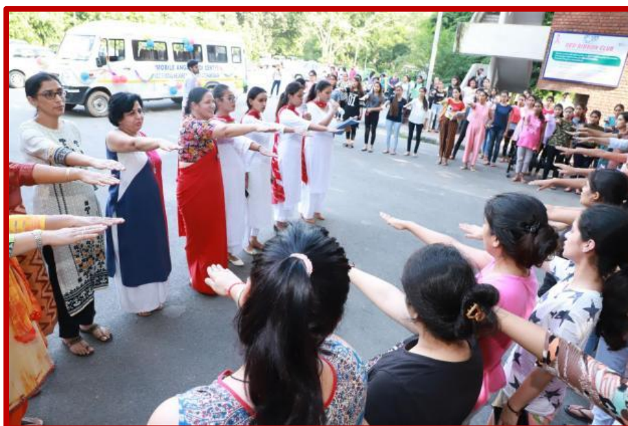
Students of GHSC- 10 taking part in Anemia free campaign