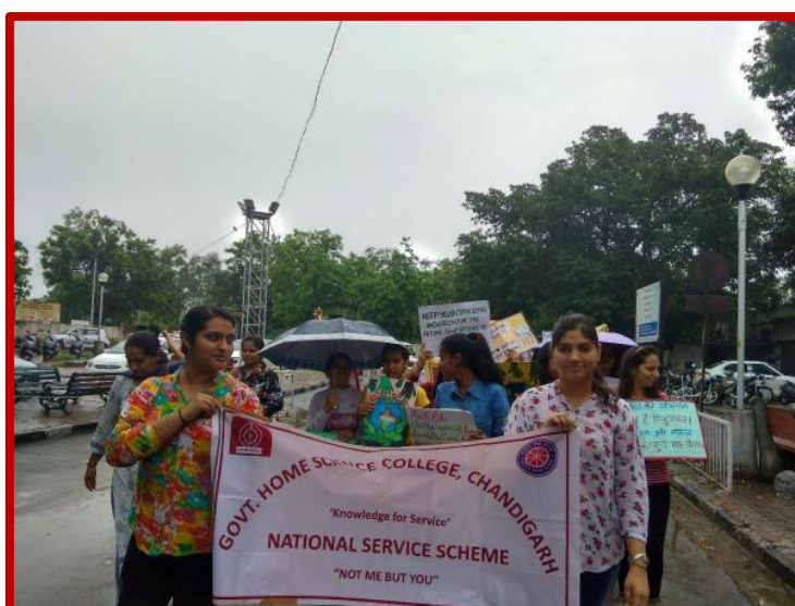
Swachhta rally conducted by NSS volunteers

Link for the Activities- https://homescience10.ac.in/news-events?page=13