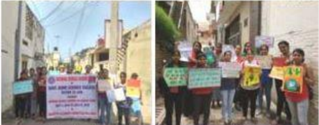
NSS volunteers organized a rally on Swachh Bharat