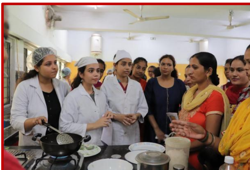
Celebration of Poshan mah at GHSC- 10

As the first part of the ongoing celebrations, a demonstration and a quiz was organized by NSS and Foods and Nutrition department students. Both these activities were conducted 50 women from villages adjoining Chandigarh. Low cost high energy nutritious recipes included categories for all age groups such as infants, preschoolers, adolescents, pregnancy and lactation. Few of the recipes demonstrated to the participants included Palak Halwa, Spinach Rolls, Multi-grain Nutritious Momos, Soya Cutlets popular amongst both adults and adolescents age groups.