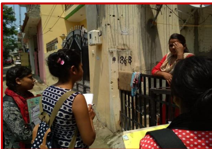
NSS students sensitising the population

To promote the Government launched scheme of Swachh Bharat Abhiyan and the services provided under the umbrella of this theme, the enthusiastic volunteers of Government Home Science College conducted a door to door campaign in the adopted village, Khuda Ali Sher to know about the prevalent problems in the adopted village, Khuda Ali Sher. NSS volunteers interacted with the local villagers by visiting their houses and discussed the problems they face related to Swachhta in their village.