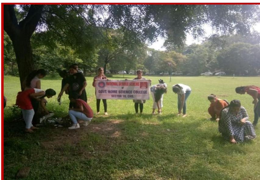
Cleanliness drive at Khuda- Ali- Sher

The students made an effort to clean all the lanes of the village and thus devoted two days for intensive cleaning. Efforts were made to involve local people so that they understand the dignity of labour and develop a habit of keeping their surroundings clean.