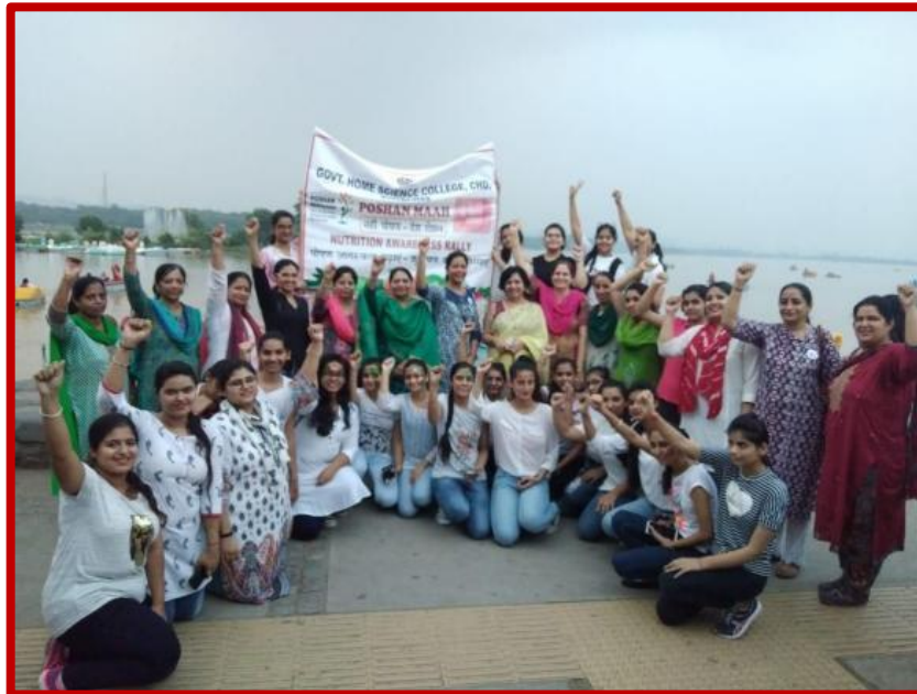
Poshan rally at Sukhna Lake

A rally supporting the cause of healthy eating under the “Poshan Abhiyaan” was conducted at Sukhna Lake . Participants of the rally comprised of more than 250 members including NSS students, teaching staff, laboratory staff, office staff and support staff of the college.The general public also enthusiastically joined in the celebrations. The activities included tattoo making and face painting by the students on nutrition related themes.