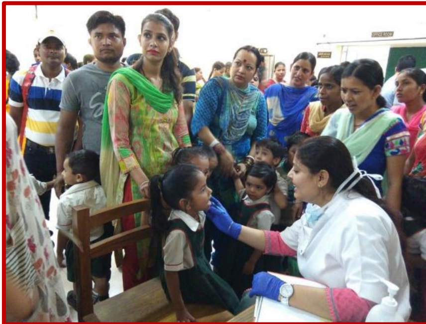
Nutrition and Health Mela at GHSC - 10

Government Home Science College organized a Nutrition and Health Mela to generate and promote awareness regarding wholesome Nourishment for good health to reduce stunting under nutrition and anemia among young children, adolescent girls and women. It was organized in collaboration with NSS wing of the college and Department of Foods and Nutrition with an aim to spread nutritional awareness, provide nutritional counseling, help in health assessment and health check – up.