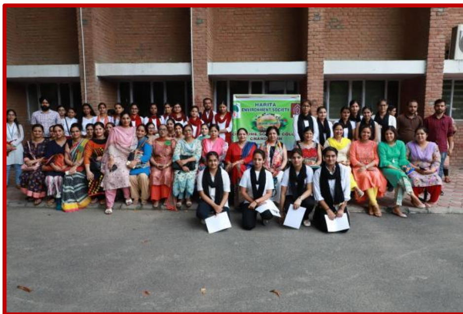
Celebration of Akshay Urja diwas at GHSC- 10

Link for the Activities- https://homescience10.ac.in/news-events?page=13