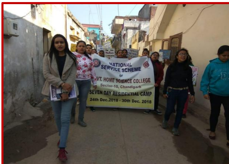
NSS students participated in Poster Making competition to generate awareness about cleanliness

Link for the activity- https://homescience10.ac.in/news-events?page=12