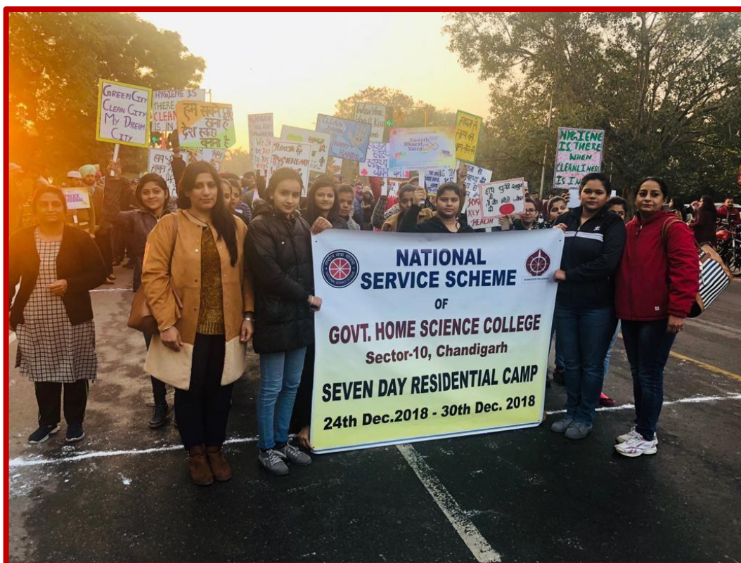
NSS students taking rally on Sensitization on importance of Eating Right at Sukhna lake Link for the activity- https://homescience10.ac.in/news-events?page=12