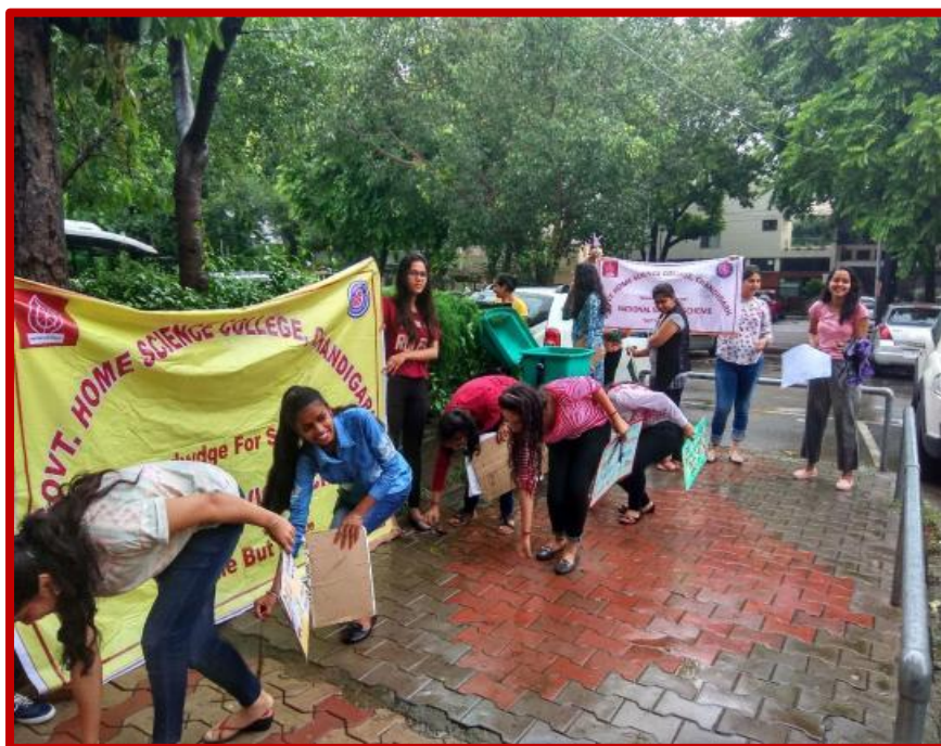
NSS students celebratin Swachhta Pakhwada

Volunteers also interacted with the public around to know more about their views regarding the Government launched scheme Swachh Bharat Abhiyan and what efforts are being done by them to bring about a change in the society