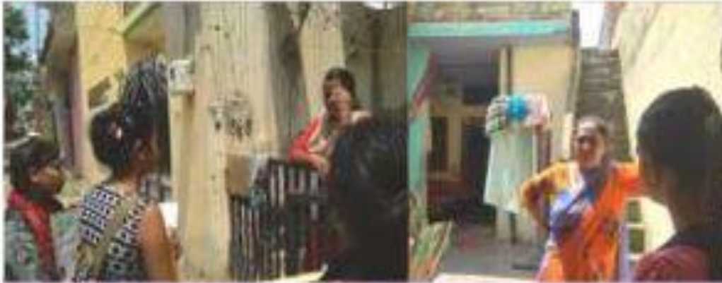
Door to Door campaign by NSS volunteers of college