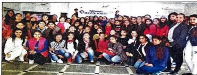
एनएसएस कैंप में भाग लेने वाली गवर्नमेंट होम साइंस कालेज सेक्टर-26 की छात्राएं।