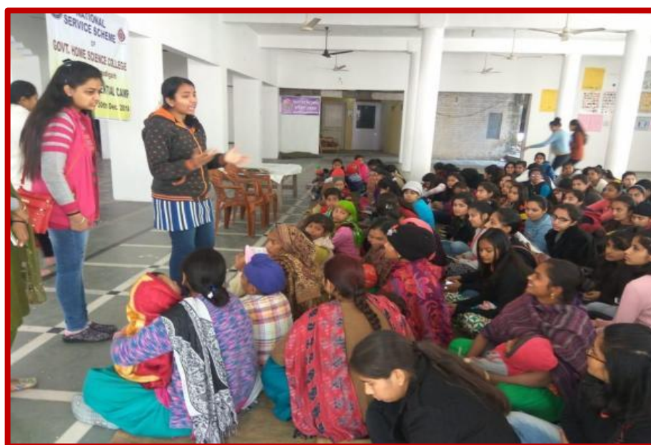
NSS students sensitising people about their health

Link for the activity- https://homescience10.ac.in/outreach-activities