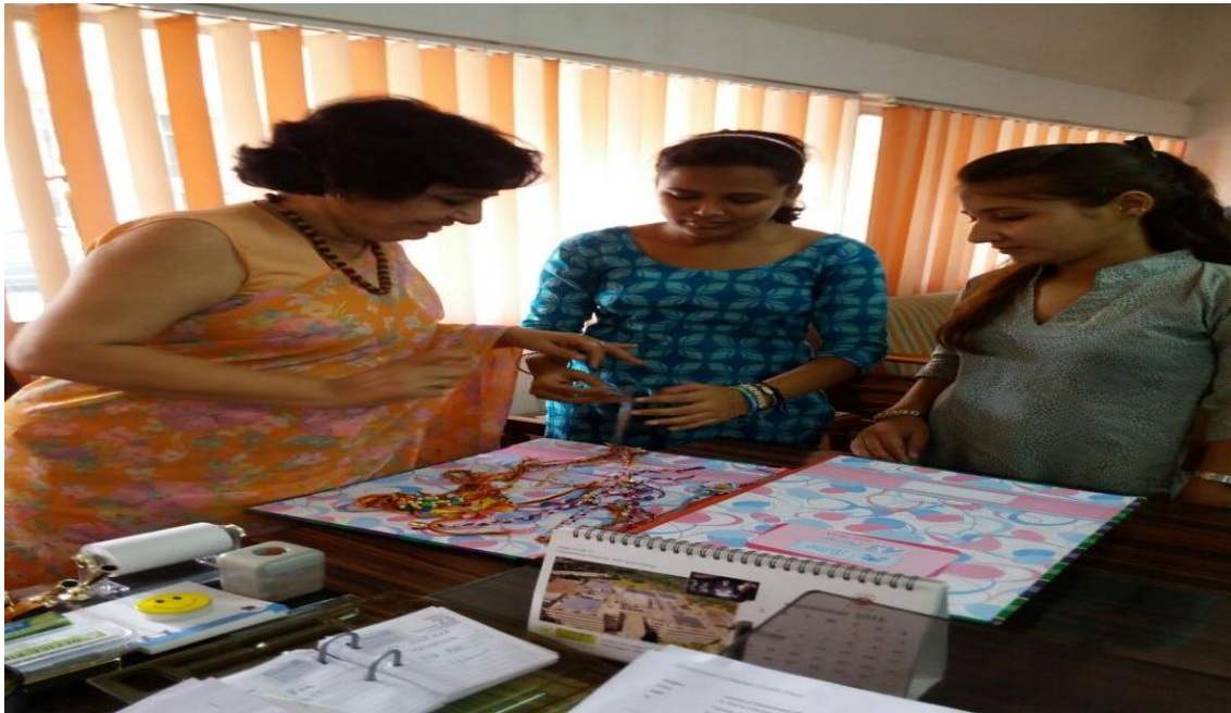
Rakhis being bought from girls of start up " Live earn shop"