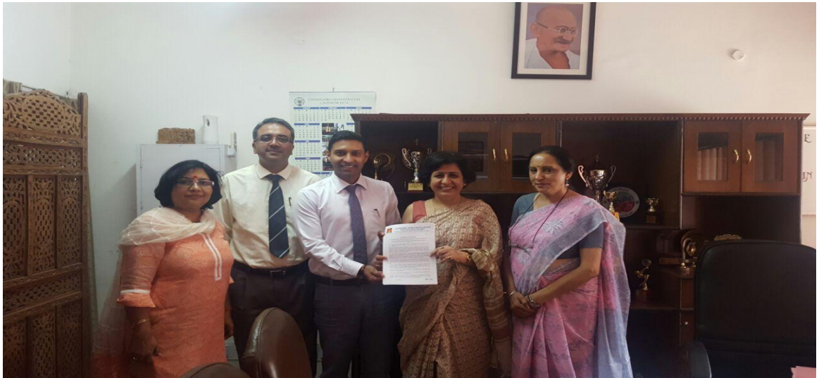
MoU being signed with State Legal Awareness Authority, Chandigarh