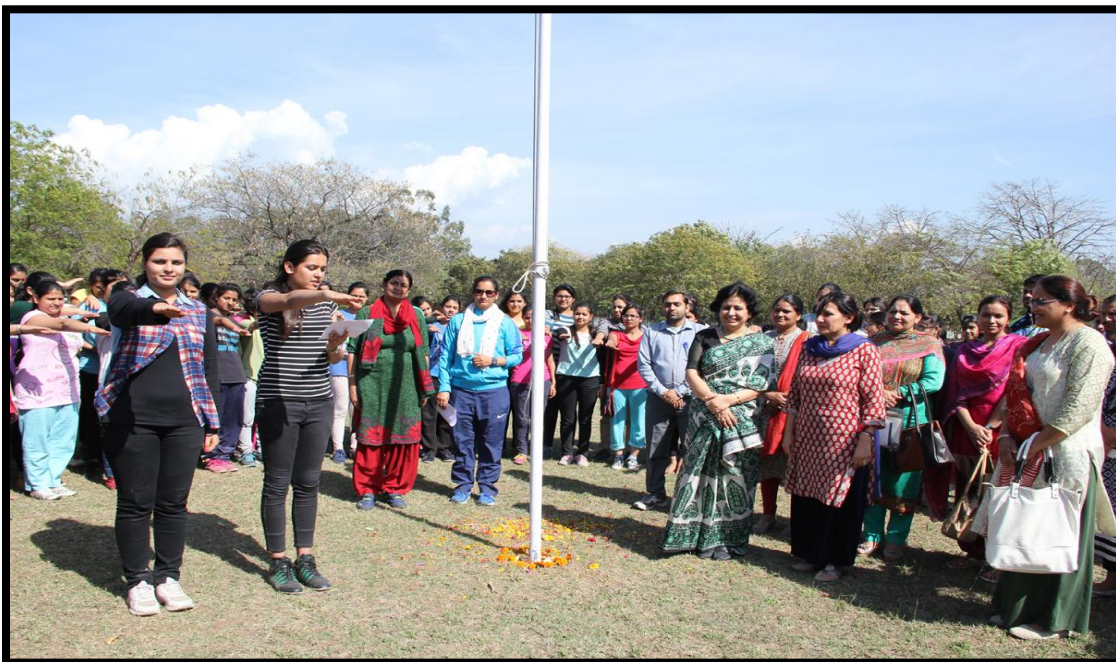
Oath being taken on Sports day

Students participated with great enthusiasm in the Sports day of the college on March 15, 2016. The day kick started with the march past and flag hoisting. The students took pledge to play fair and with full sportsmanship. Students were involved in varied races like chatti race, three legged race along with track events.