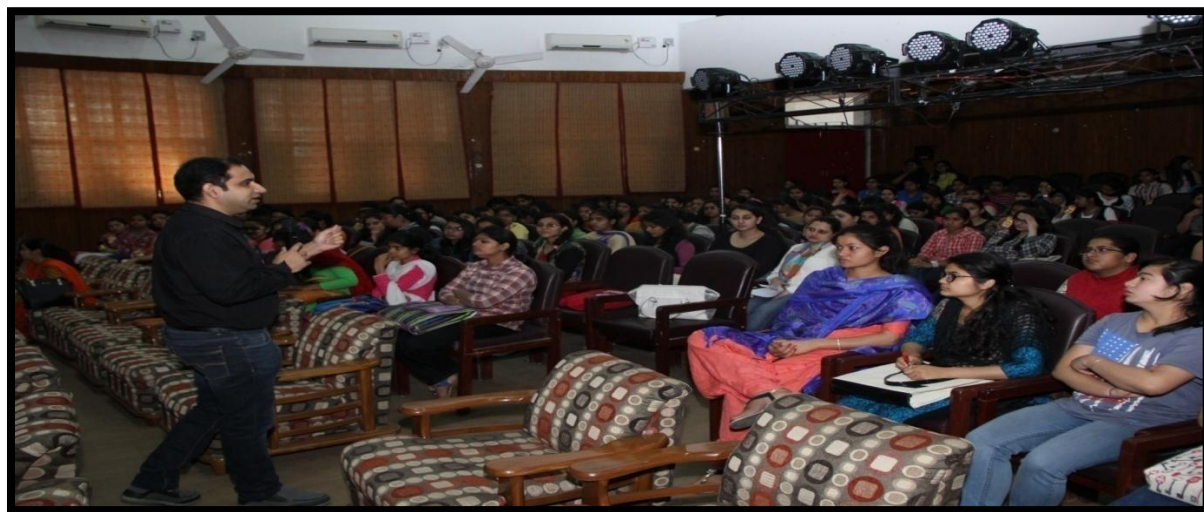
Career Counselling Session for the Students