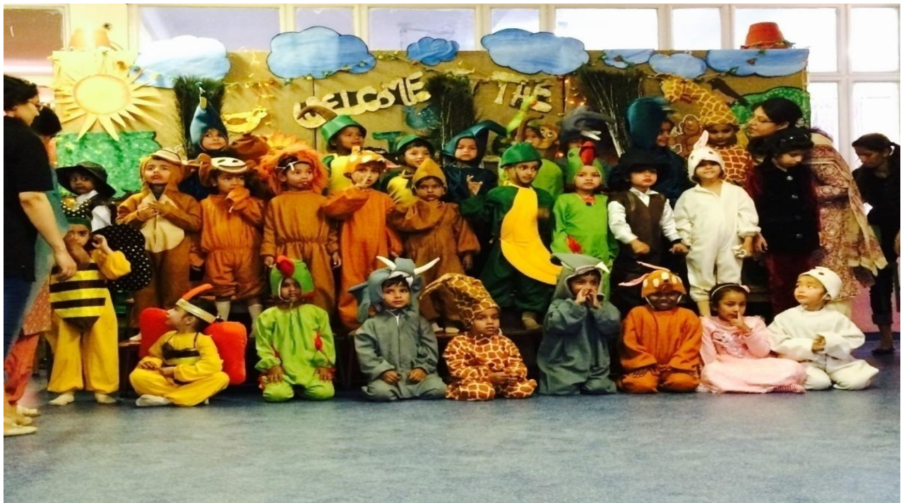
Tiny Tots of Chaitanya Staging A Play on Theme Jungle

Children's Annual Day Function was organized with the help of P.G. students & staff of the Department of HDFR.