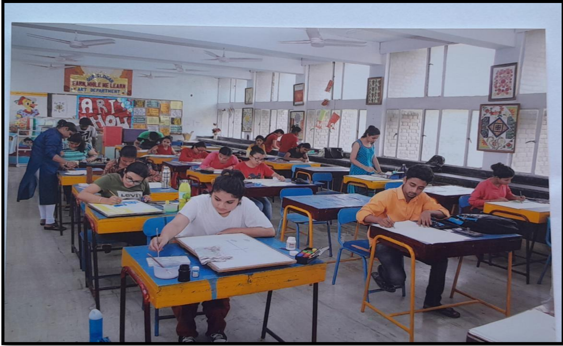
Students Participating in Poster Making Competition