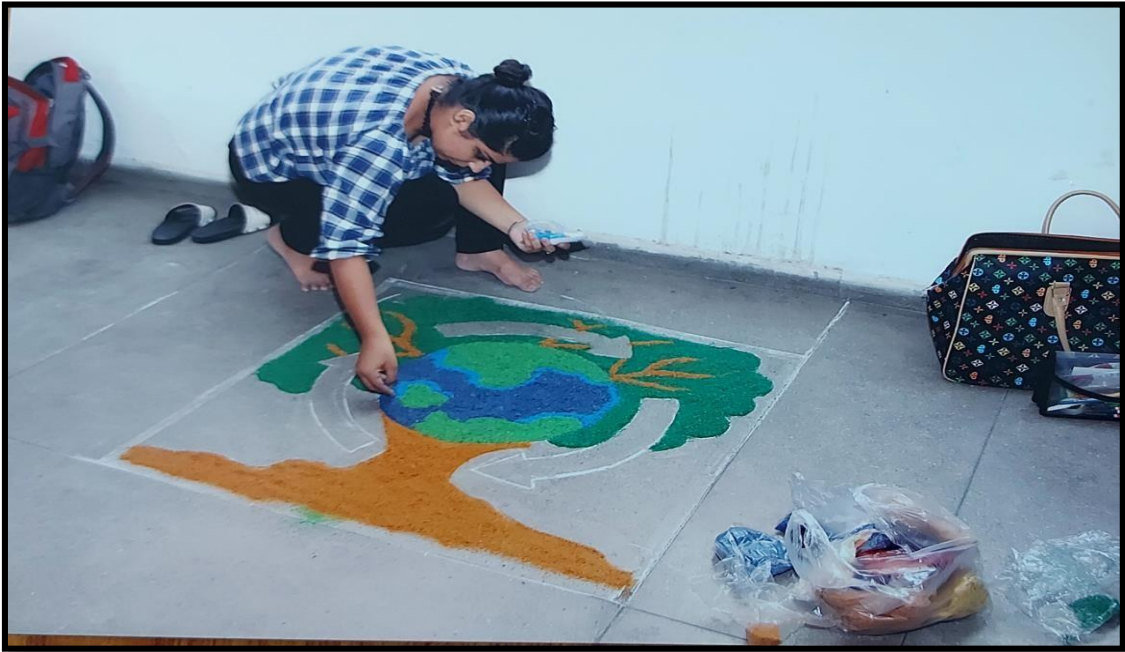
Rangoli making Competition