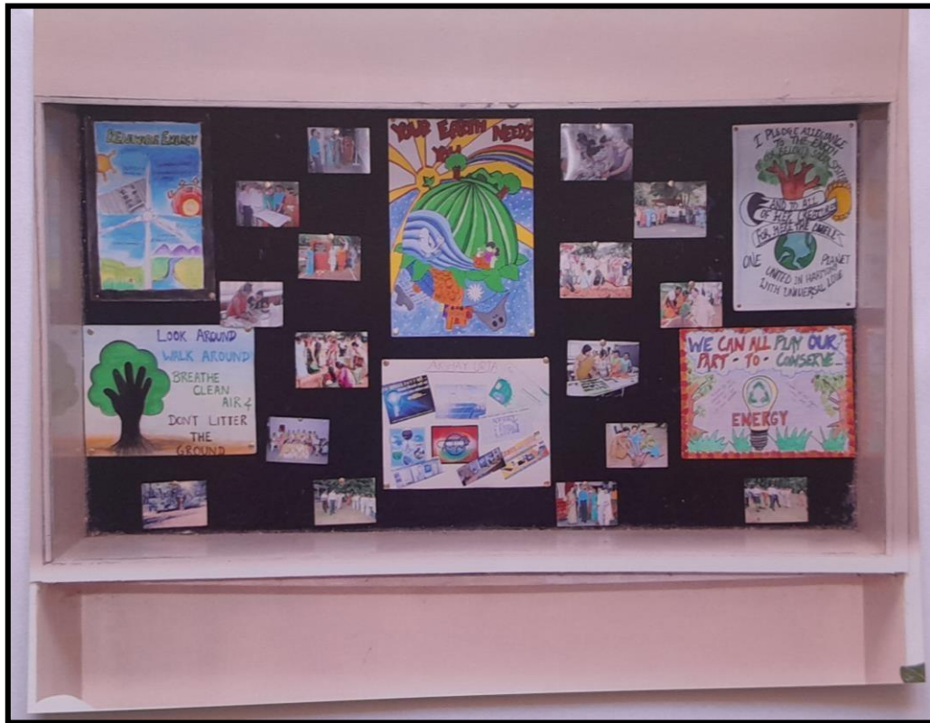
Spreading Awareness through Poster Presentation