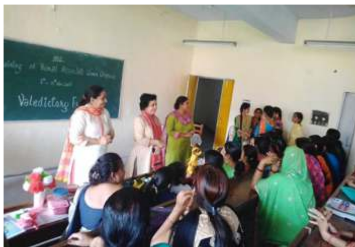
Rural associate women sharing their experiences of training program with the Principal

The college organized a seven day training program for Rural Associate Women. The women were apprised of various aspects in home science that can help them lead better lives. The valedictory function was held on the last day. Prizes were distributed to talented Rural Associate Women Workers by the Principal of the college.