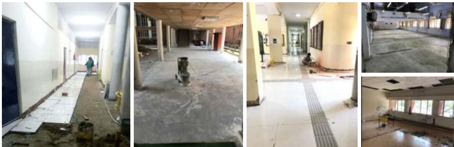
Disabled friendly tactile flooring of corridors

This academic year 2017-2018 began with the accomplishment of the college becoming eligible for getting the first installment (Rs. 1 crore) of RUSA infrastructure grant of Rs. 2 crore from MHRD. RUSA aims to help in up gradation, renovation and purchase of equipments to help in providing quality higher education. The grant has been spent on giving a facelift to the corridors (at ground floor) and administrative block (1st floor) by getting vitrified tactile flooring and making it disabled friendly. Flooring of library has been made vibrant, colorful and sound absorbent with glass doors so as to prevent escape of cool air in summers. It has also been utilized in procuring digital podiums, interactive LED screens, visualizers, printers, projectors and latest computers for E-Pathshala & conference room. Though the time period of spending Rs. 1 crore was just 6 months; college was able to meet this deadline and became eligible for release of second installment of this grant amounting to Rs. 50 lakhs. Amount of Rs. 35 lakhs has been deposited with the Engineering Department of Chandigarh Administration for construction of research multimedia block.