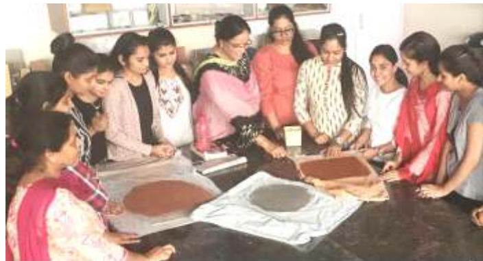
Making Handmade Paper