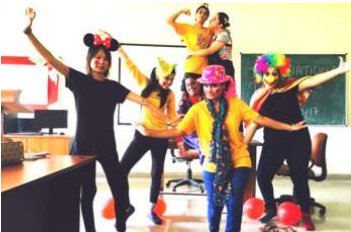
Students Dressed as Jokers and Fun Characters Spreading HAPPINESS in the College