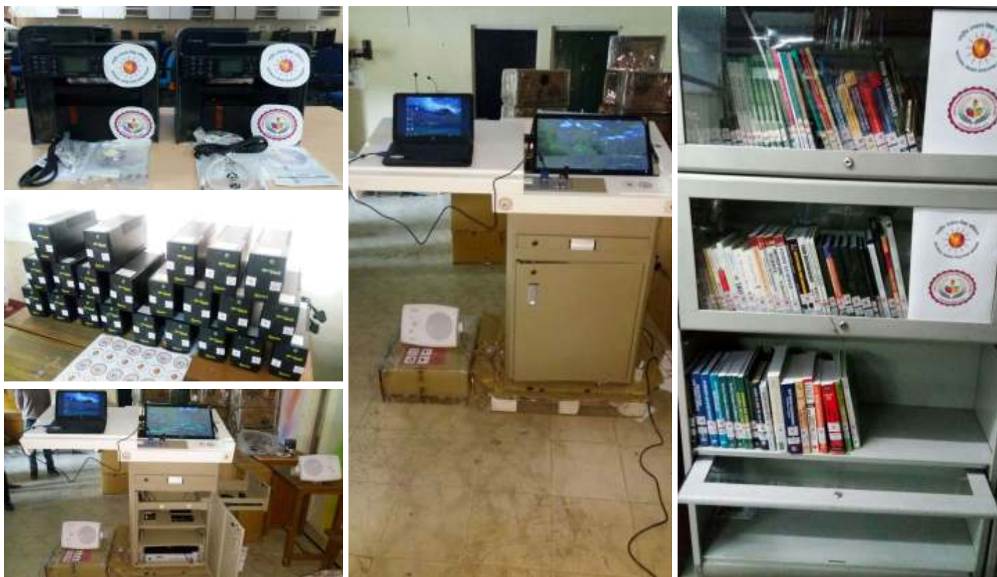
Strengthening e-resources for up coming E-pathshaala