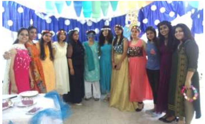
Fairytale Land theme created by Bachelors Students