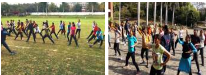
A 10 Days Self Defense Training Program in Collaboration with Chandigarh Police under the theme "SWAYAM" (March 20-31, 2018)