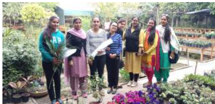
Visit to understand use of Sustainable Plants