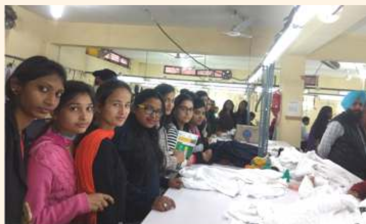
Students Visit to Entrepreneurial Units in Tricity