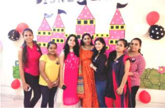
DISNEYLAND Themed Décor by the Students