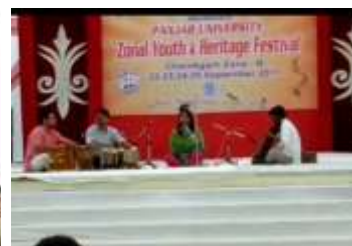
Students Performing at Inter Zonal Youth Festival Panjab University