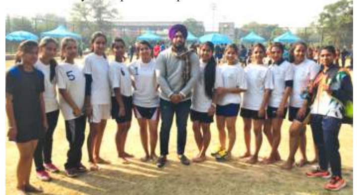
Kho-Kho Team of The College