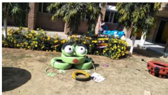
Best Out of Waste