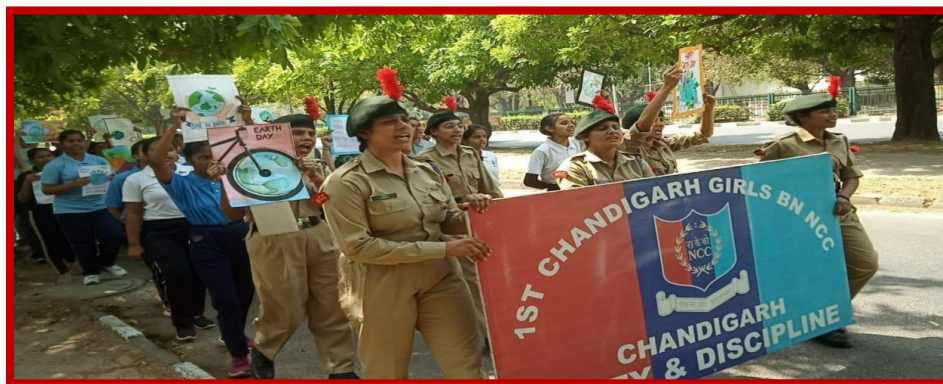
World environment day