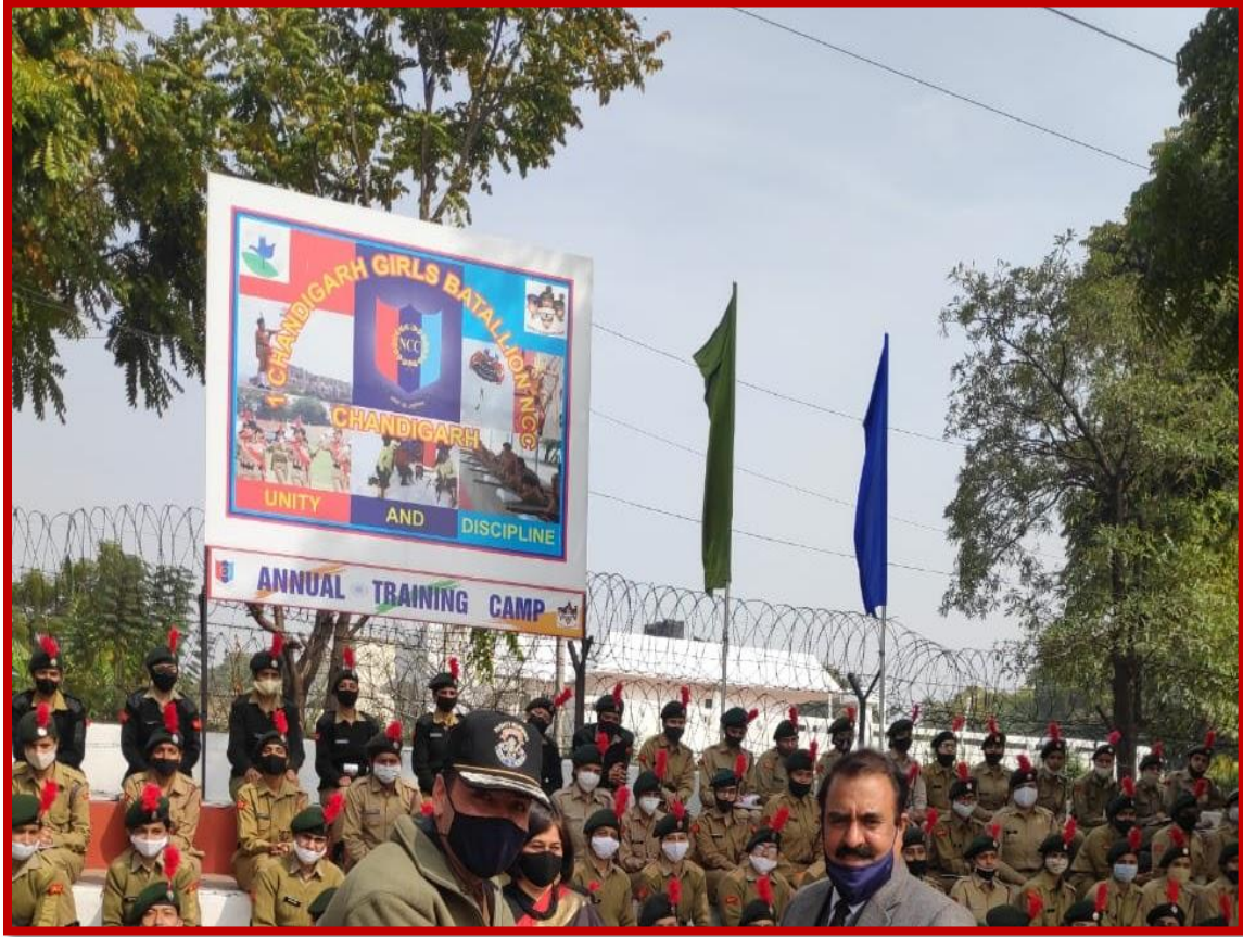
Annual Training Camp