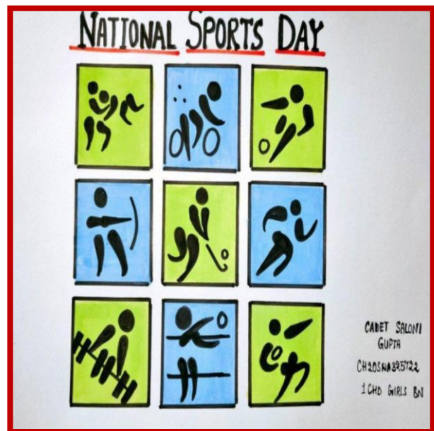
National Sports Day Celebration