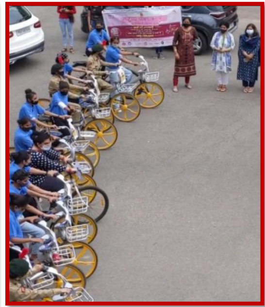
Fit India Freedom Cyclothon