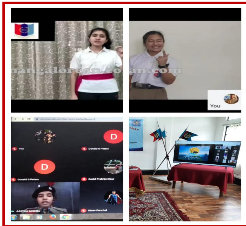
Online EBSB 5 day camp

The Online EBSB (Ek Bharat Shreshtha Bharat) camp was a five days camp; held online which commenced on 25th January 2020 and lasted till 30th January 2020, ‘Ek Bharat Shrestha Bharat’ of NCC is an annual camp for national integration conducted between paired states. The aim of the camp is to foster a sense of unity and nationalism amongst the participating NCC cadets and familiarising with the paired states.