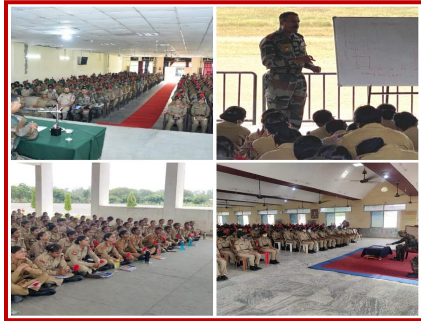
Personality Development and SSB camp

A 10-day personality development and SSB camp for the NCC cadets is underway at the NCC Academy, Ropar city in Punjab. The camp which started on 20-01-2019 concluded on 27-01-2019. cadets of 1 CHD GIRLS BN and Government home science college sector -10, Chandigarh attended this camp very enthusiastically. The camp aims at instilling confidence among the cadets and provide them a launching platform where they can sharpen their skills. Assignments and activities are being given to the cadets during the camp so as to help them clear SSB Board and join armed forces. The camp is being attended by NCC cadets from different NCC Groups of Punjab, Haryana, Himachal Pradesh and Chandigarh. Group Commander motivated the cadets to become better citizen and exhorted them to join armed forces to serve the nation. Cadets are being imparted special training in communication skill, personality development, life skills with video presentations, documentary movies and banners.