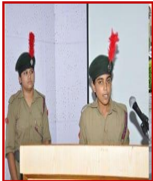
Basic Leadership Camp in Malout