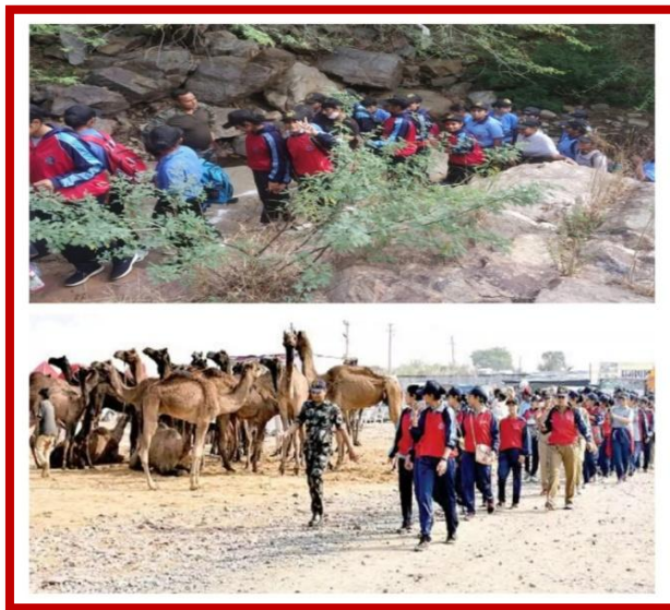
Trekking Expedition in Ajmer, Rajasthan