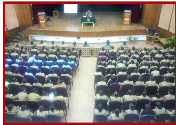
Annual Training Camp for the training year 2017-18 at Govt Home Science College, Sector 10, Chandigarh