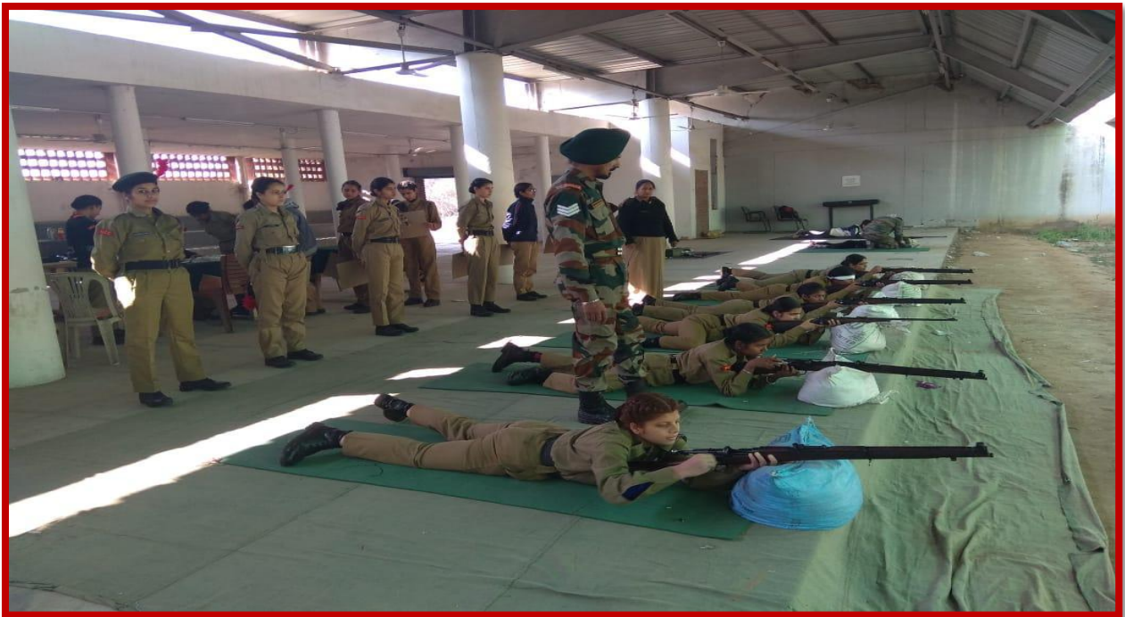
Shooting practice session at Shooting Range, Sector – 25 Chandigarh

Shooting sessions are carried out for NCC cadets in which the 0.22 Deluxe rifle is usually used. Here cadets learn different positions of firing, how to aim, trigger and know about various parts of a rifle. This year Shooting practice session was held at Shooting Range, Sector – 25 Chandigarh on 17th January, 2018. It was organized by NCC Unit. Cadets Home Science College sector -10 Chandigarh were part of it and enhanced their shooting skills in shooting session organized by 1CHD GIRLS BN NCC Chandigarh.