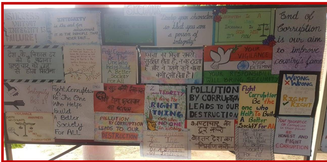
Slogan writing competition