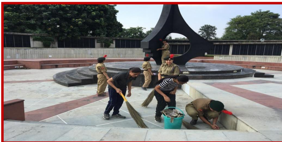
Cleaning the War Memorial