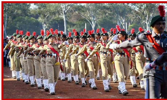
Independence Day Parade at Sector – 17 Parade Ground, Chandigarh