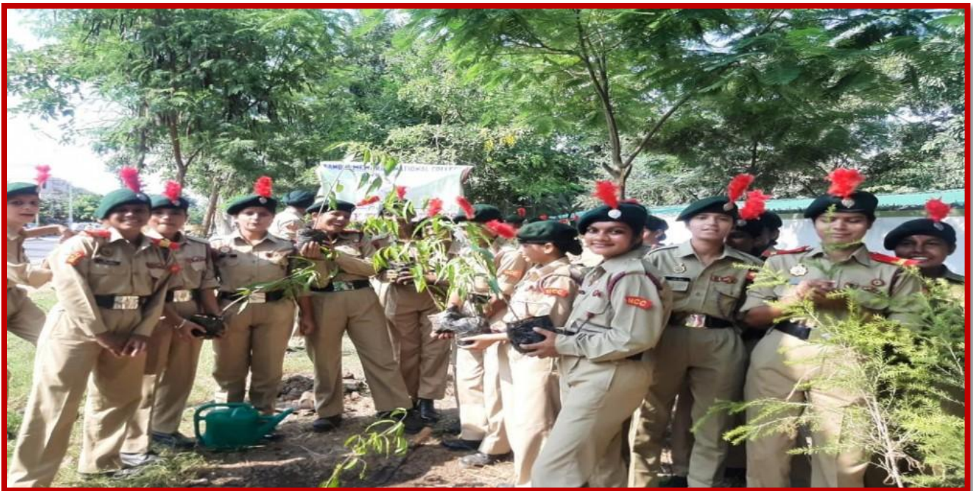
Tree Plantation Drive

In view to support Government's initiative to plant more trees, Tree Plantation Drive was organized on 26th July, 2017 at Home Science College sector-10 Chandigarh in collaboration with NCC Unit. The students actively participated in the event and more than 40 saplings which were provided by the NCC Unit 1 CHD GIRLS BN were planted in the college campus. The cadets participated in the drive enthusiastically and helped each other in planting the saplings. The cadets along with the also took an oath to look after the planted saplings, plant more and more trees and encourage others to do the same. Some of the students also shared their experiences and shared their joy with others. Such little steps taken together by will surely help in fostering strong mental and social health amongst today's youth.