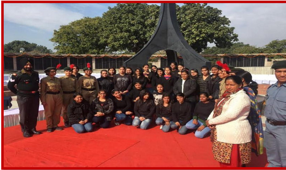
Visit to War Memorial, Chandigarh