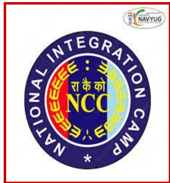
National Integration Camp at Dhanbad