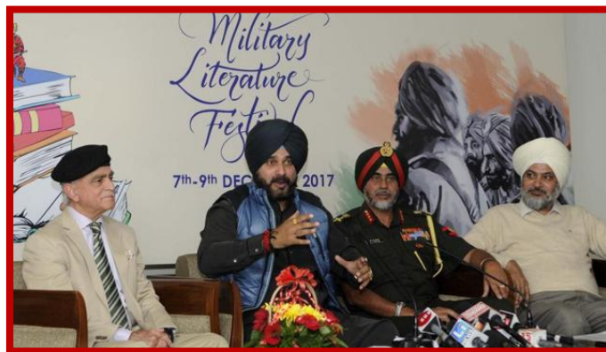
Military literature festival at Lake Club